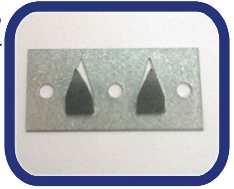
MetroFlex 2-Prong PushDown Impaler Clip

MetroFlex 2-Prong PushDown Impaler Clips are designed to make fastening Acoustic Panels to walls fast and easy. MetroFlex Push-Down Impaler Clips are made of galvanized steel and contain 2 Angled Prongs per clip. The PushDown clips are designed to work with both Fiberglass and Mineral Fiber Panels with densities from 3# up to 8# (per cubic foot).