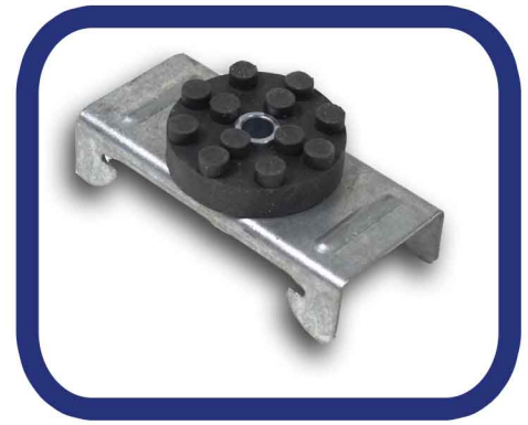
MetroFlex Resilient Sound Isolation Clip

Buy Insulation Products distributes MetroFlex Resilient Sound Isolation Clips which are designed to decouple drywall from a wall or ceiling structure. MetroFlex RSIC clips are easy to install by simply being screwed to existing wood or steel studs/joists. Resilient Channel is held in to place by clips spread no more than 48" apart. Drywall is then installed on top of the Resilient Channel by simply being screwed into the channel strips. MetroFlex Resilient Sound Isolation Clips can reduce noise transfer from between 75% to 100%. MetroFlex RSIC Clips have been tested to be part of assemblies that have STC Ratings of up to 64 !