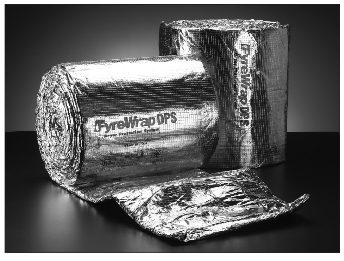
FyreWrap® DPS Insulation - Dryer Protection System

Core Material: FyreWrap DPS Insulation incorporates Insulfrax® Thermal Insulation as its core material. Insulfrax is a high-temperature insulation made from a calcia, magnesia, silica chemistry designed to enhance biosolubility. It provides excellent insulation in a noncombustible blanket product form.