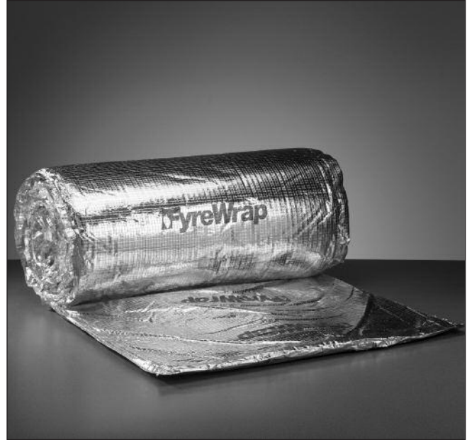
FyreWrap 0.5 Plenum Insulation